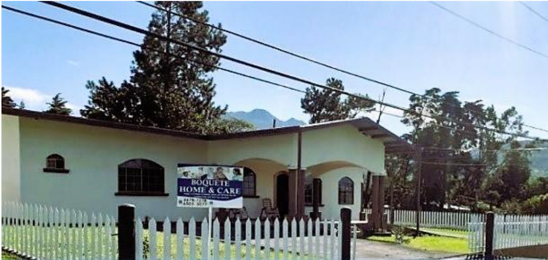
Boquete Home and Care in Alto Dorado